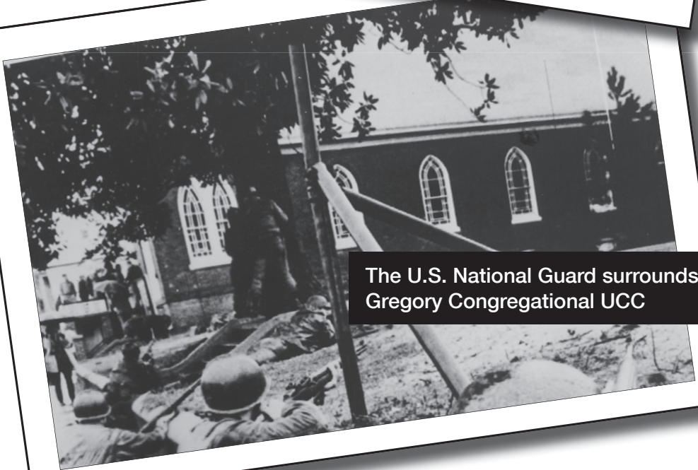
The U.S. National Guard surrounds Gregory Congregational UCC

God is still speaking, UNITED CHURCH OF CHRIST